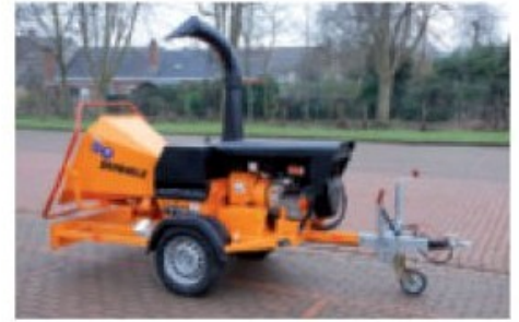
Diesel engine driven machine on road trailer

The smallest performer in the range. For chipping of twigs, branches & stems of any type of wood with maximum diameter of 120mm / 5". Available in tractor driven version and diesel engine version.