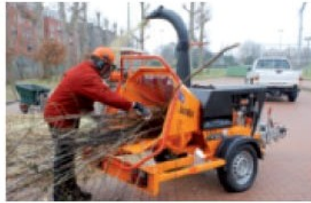
TVI 20 D; Powerful, largely specked diesel engine.