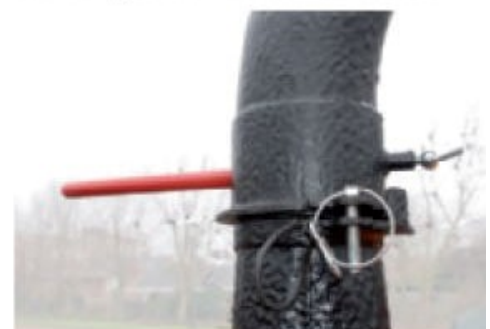
Exhaust chute 300° turn able (safety), transportation locking system included.