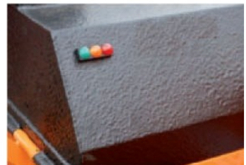
Anti-Stress system comes standard on diesel machines, optional on tractor driven units.