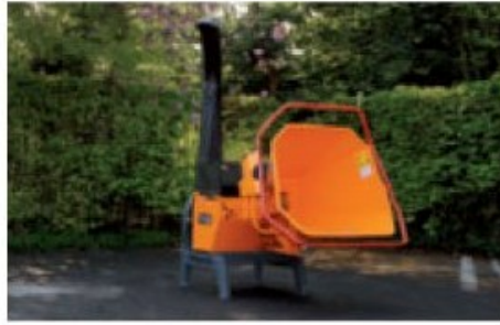
Standard tractor driven 3-point machine