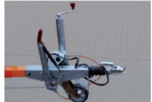
TVI 20 D; Trailer with over run brake system.

B : 1450mm H1: 2300mm H2: 2150mm H3: 1810mm L : 3650mm