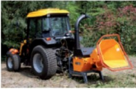
TVI 20 P; Can be powered by small tractors, as from 20 HP.