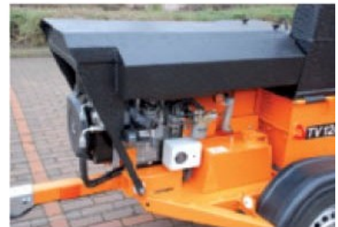
TVI 20 D; Air cooled LOMBARDINI diesel engine, 2 cylinder, 21 kW - 28.5 HP.