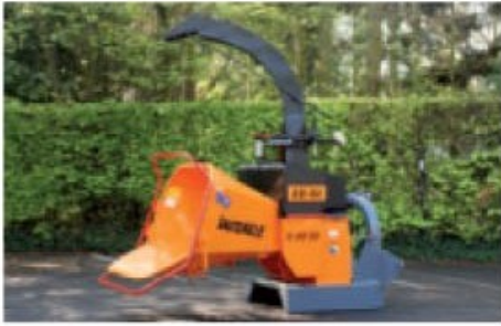
TV22-32 P; tractor driven.