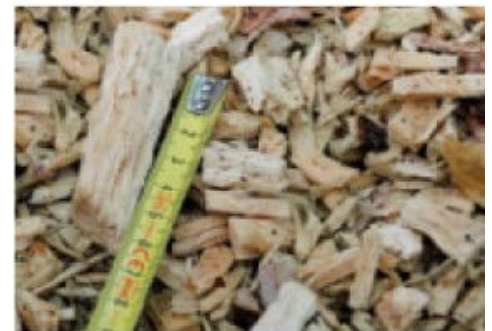
TV22-32 P; chips are applicable in heating applications and for energy production purposes (optional).