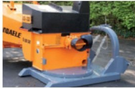
TV22-32 P; tractor driven on a 2x90° turn table (optional).