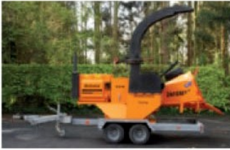
Diesel engine driven, on high speed trailer – standard machine with 70 HP Hatz engine.