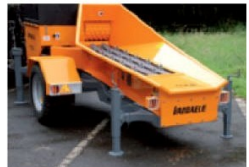
Option crane funnel – version with extra long feed table and on slow speed trailer: