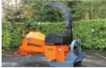
Tractor version on a standard 3-point hitch