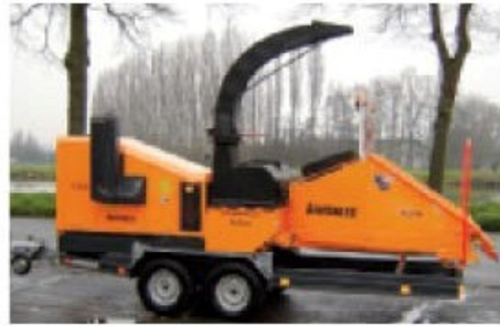
Diesel engine driven, on high speed trailer – heavy duty version with 135 HP Deutz engine.