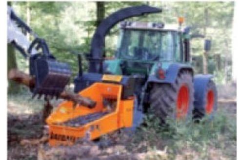
Option crane funnel – infeed via separate crane.