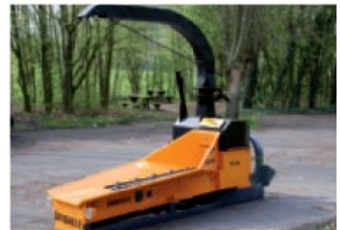
Option crane funnel – version with extra long feed table and chain.