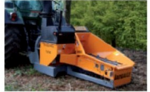
Special crane feed funnel with steel chain infeed belt system (optional).

The most versatile model in the Vandaele chipper range. This model is available in several versions. Such as: standard hand feed machine, diesel engine driven, specially adapted units for forestry applications with funnel for crane feeding, machine with rubber infeed belt system for recycling park applications, etc. . .