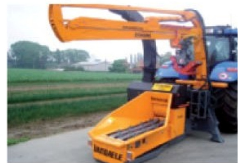
Option crane funnel – infeed via middle mounted crane.