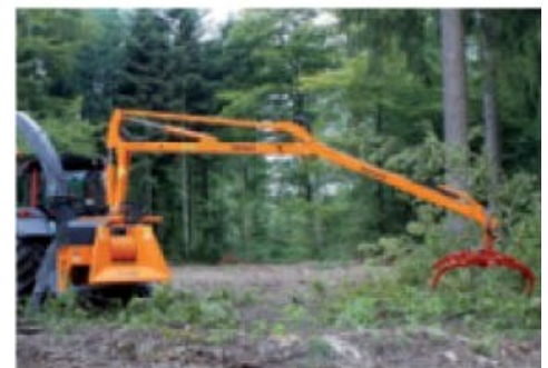
The FC400 comes standard with a forestry crane with a parallelogram system.