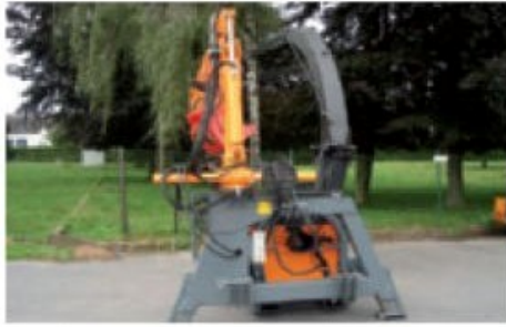
Special adapted A-frame with hydraulic stabilizers for mounting the forestry crane.