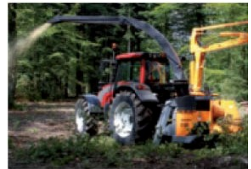
Extra long hydraulic tum able ejector chute for blowing material over the tractor cabin.