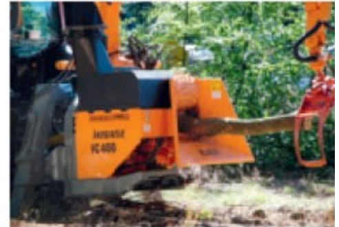
Adapted, extra short, extra reinforced infeed funnel, foreseen for crane feeding only.