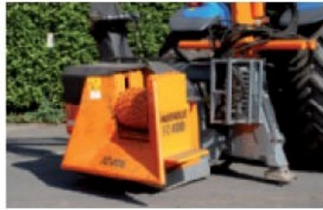
Special designed open top cover to expose the top infeed roll. This guarantees an optimum visibility on the infeed system.