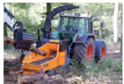
Alternative unit = TV27-40 wood chipper with adapted funnel with steel conveyor belt for crane feeding.