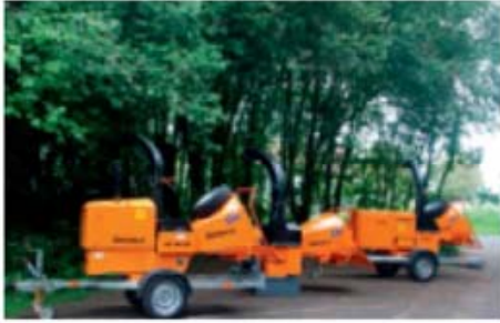
Large range of hand fed wood chippers to choose from.