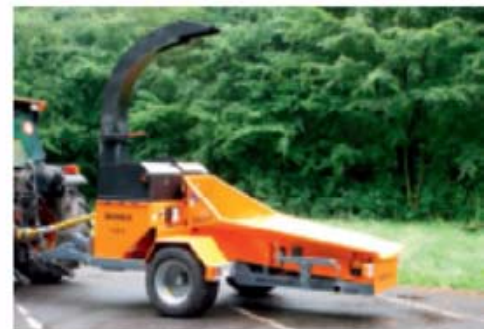
TV27-40 with extended crane feed funnel on trailer (optional).