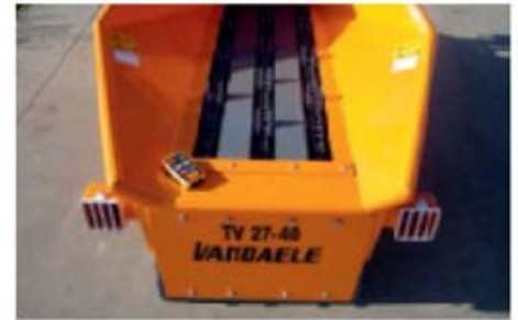
Specially adapted crane feed funnel for forestry applications: reinforced, open structure

Vandaele is a manufacturer of high quality machines for green keeping and verge maintenance. Since well over 20 years now, we build a large range of wood chippers, specially aimed at the professional user market.