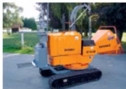
Self propelled unit on a tracked undercarriage – different models / possibilities.