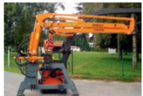
Wood crane with parallelogram system on special built A-frame and adapted 3-point system.