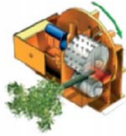
Two horizontal infeed rolls, each one driven by its own hydraulic motor.