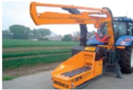
TV27-40 crane feed unit and crane combination, built on an adapted 3-point frame.