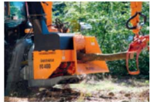
Model FC400, specially developed for forestry; optimum visibility on the infeed opening.