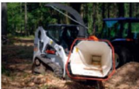
Hydraulic powered wood chipper on a tool carrier – different models available.