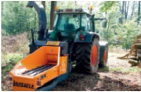
TV27-40 crane feed funnel with steel conveyor belt for automatic feeding.