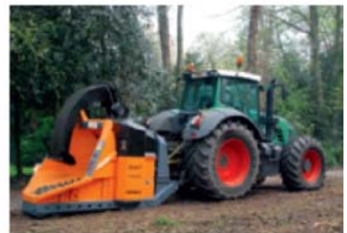
TV40-52 "GIANT" = the biggest machine in our range – insatiable.