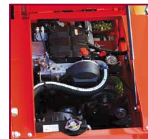
LOMBARDI ENGINE 2 CYL 18 HP