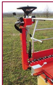
UPLIFTING & TOWING KIT

* OPTIONAL L2= DIESEL LOMBARDINI 2 CYL. - 18 HP *Road homologation