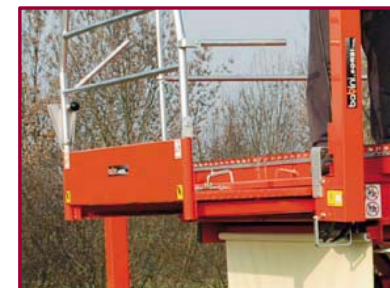
SLIDING PLATFORMS MECHANICAL OPENING